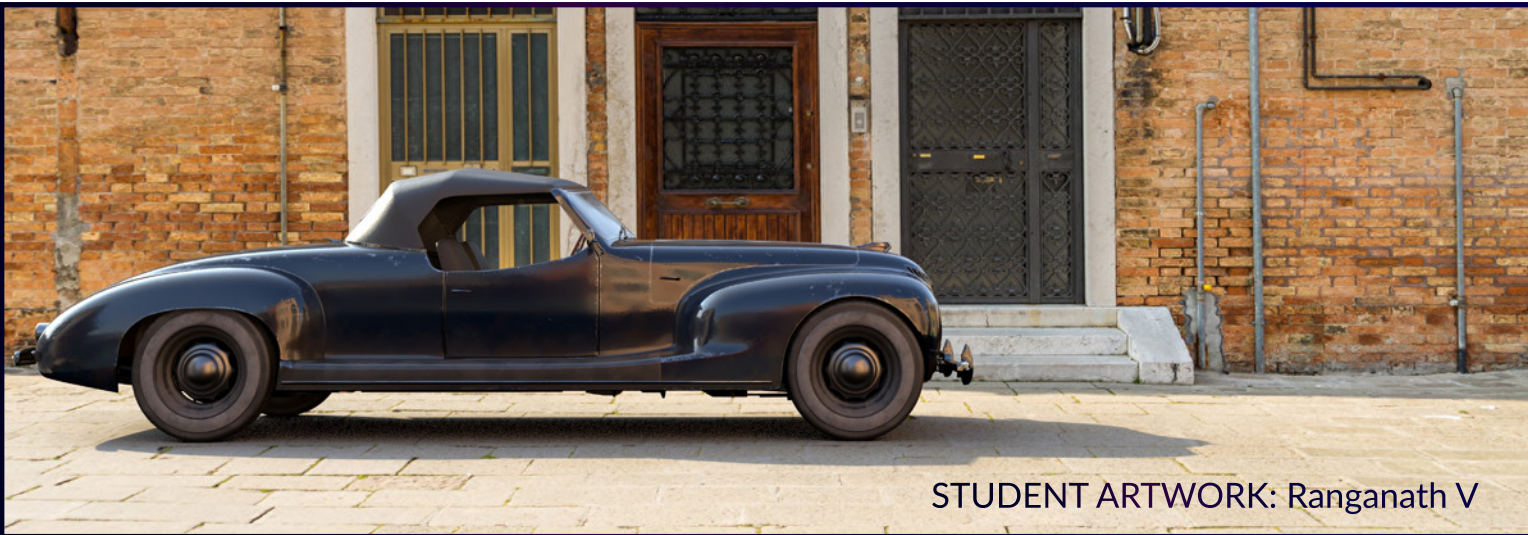
STUDENT ARTWORK: Ranganath V

This two-year, full-time diploma program is perfect for students who are interested in a promising career in VFX. During our six 16-week long terms, you will take 24 custom-designed courses centred on advanced skills in cutting-edge visual effects and virtual production. Areas of instruction include virtual production as well as modelling, sculpting, texturing/surfacing, lighting, compositing, and FX. Our small class sizes (approximately 25 students) will provide you with the opportunity to interact directly with qualified instructors and work closely with your fellow students.